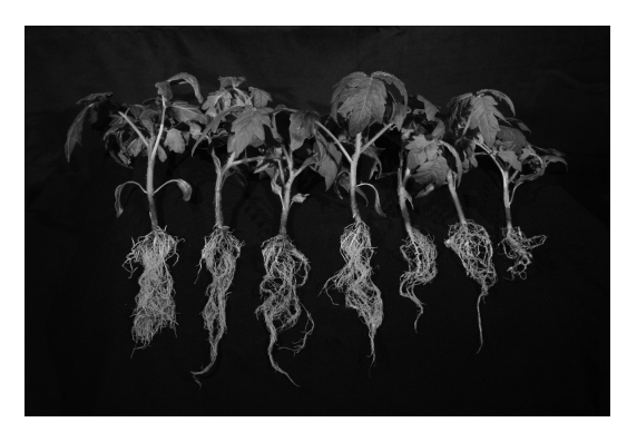
FIGURE 3: Tomato seedlings from Replicate 1 at harvest (28 days post Meloidogyne hapla inoculation) in the nematode damage function experiment. Left to right: inoculation rate of 0, 200, 370, 1700, 3080, 6700 and 13880 M. hapla eggs.