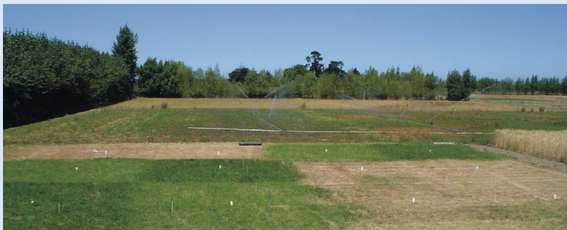
Figure 1. Treatments (left to right at bottom of photo) are : I+N, I-N, D+N and D-N respectively. (Photo taken 15 Jan 2004).

During periods of water stress the D+N yield increased at a similar rate to D-N pastures (1.5 kg DM/°Cd). After rainfall, the rate of D+N DM production was similar (7.1 kg DM/°Cd) to the I+N treatment.