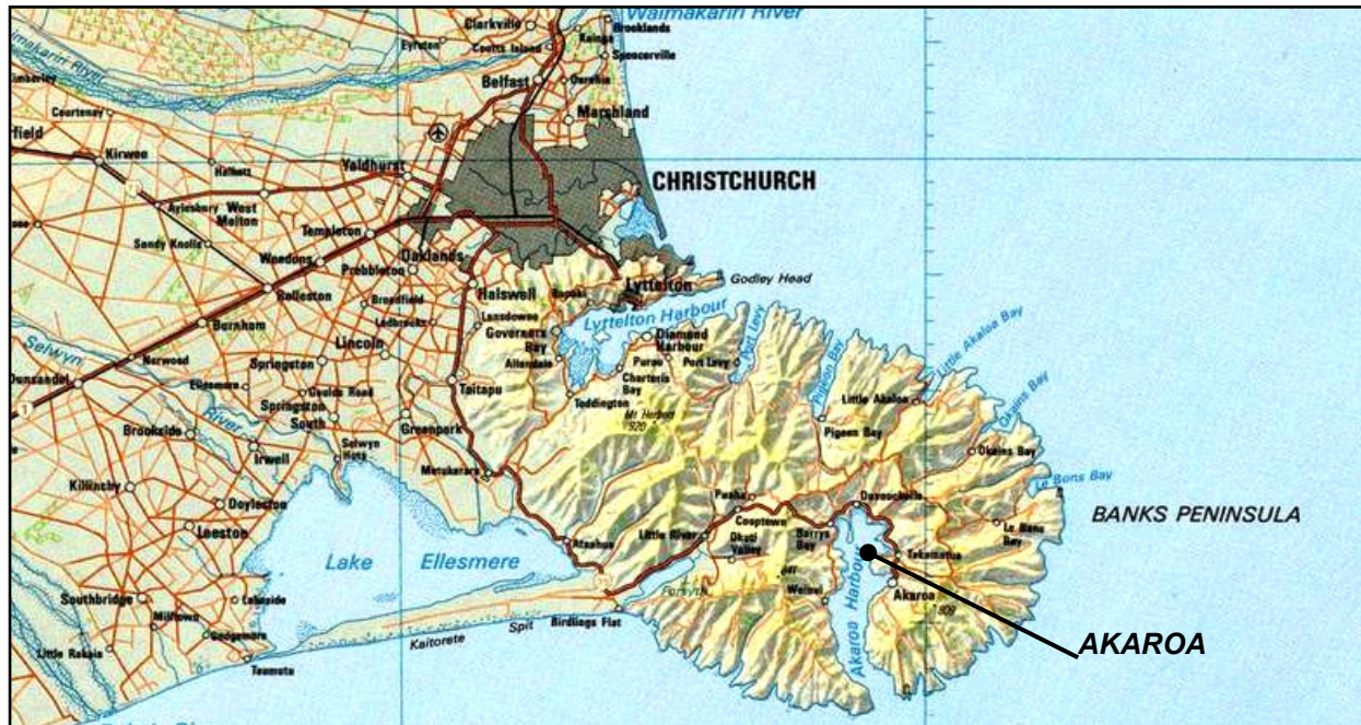
Figure 2 Map of Christchurch and Akaroa