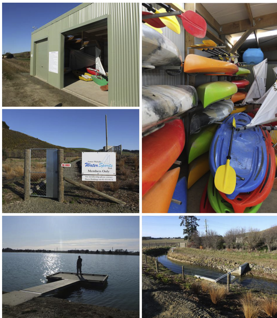
Fig. 4. Collage of the Lower Waitaki Water Sports Park.

intermediate school are using it for the next five Fridays. They've used it quite a bit actually. They just come out yachting and kayaking and its part of their outdoor sport programme (Local School Teacher).