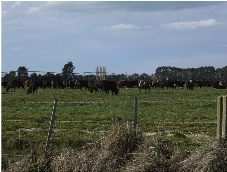
Fig. 2. The Waitaki Valley dairy farm landscape.

close to Oamaru and we were aware of a lack of flat-water spaces around that you can use safely for recreation. The sea is angry here and the Waitaki Lakes are an hour away ... so we decided to set the Pond up to provide the community with a local recreation (Farmer Shareholder 1).