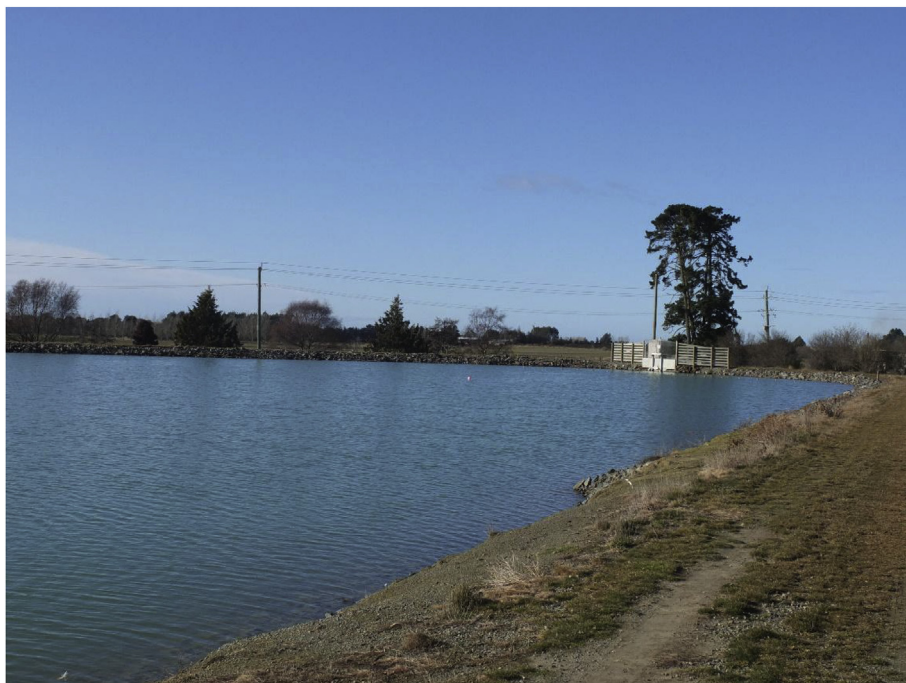
Fig. 3. The Ferry Road Buffer Pond.

At the outset, the Company simply gave local people access to the pond and publicised the fact through a variety of local media channels. As one farmer shareholder recalled: