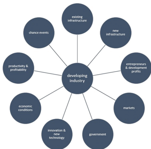
Figure 1: Proposed factors in the development of the Canterbury dairy industry

Informants did not consider that there was a large involvement of government in the development of the Canterbury industry. However, there was recognition that the major growth occurred after the removal of most government support for agriculture in the 1980s. The removal of price supports, particularly to the sheep and cropping industries in 1984 (Rayner, 1990), meant that these farming systems became less economic and, so were more likely to be sold or converted to other farming systems such as dairying. The loss in profitability of the historic sheep and cropping systems was a major driver of development. In general, farmer informants focused on 'close to farm' factors and did not identify, without prompting, the efforts of government in international trade negotiations or changes in international markets.