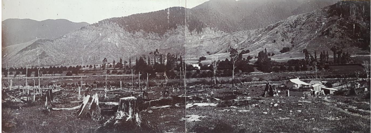
Figure 5: Native timber clearing in Pelorus – note the hills have been cleared as well. The small cottage looks south across the Pelorus River. Image taken circa 1900-1910.