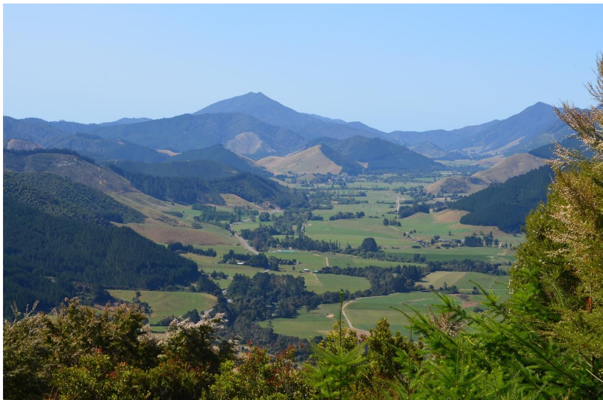
Plate 1: Looking down Rai Valley from the Mt Richmond ranges, behind Pelorus Bridge café. January 2020.