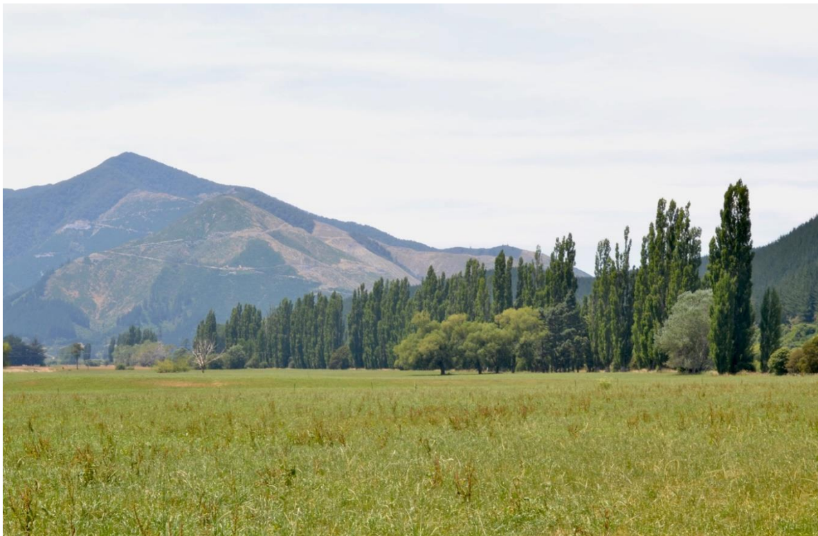
Figure 3: This photo was taken on the Te Araroa trail, looking down the Pelorus/Te Hoiere river (facing east).

Source: LCDB5 (2018) with top 10 land uses by area shown (courtesy MDC).