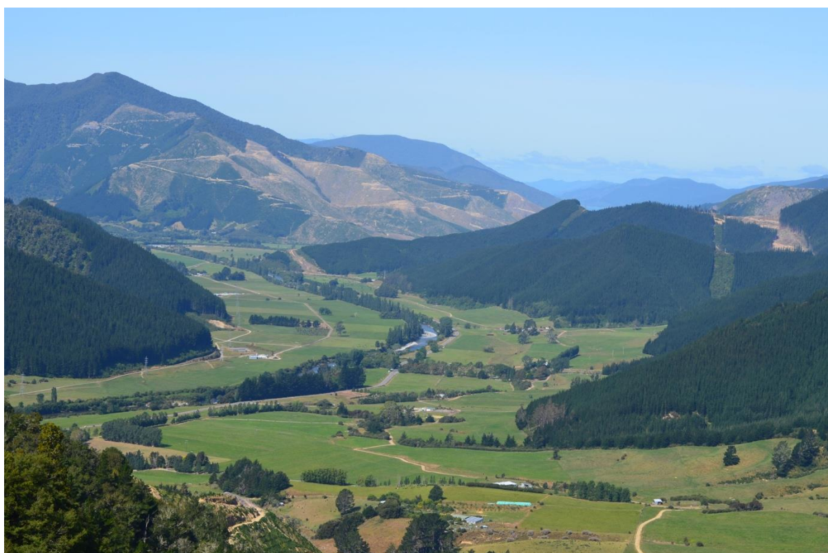
Plate 2: Looking upstream the Pelorus/Te Hoiere River emerges from the Mt Richmond range, behind Pelorus Bridge café. Photo G. Coutts, January 2020.