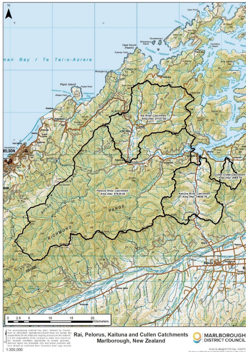
Figure 1: Map of Rai, Pelorus/Te Hoiere, Kaituna and Cullen catchments. The Pelorus/Te Hoiere includes the Rai and Whakamarino (Wakamarina) catchments.

The Pelorus/Te Hoiere catchment lies between Blenheim and Nelson, in the northern part of Marlborough (Figure 1). The catchment extends over approximately 889 km 2 or 88,959 hectares (ha) and includes the Rai and Whakamarino (previously Wakamarina) catchments. The Pelorus/Te Hoiere discharges into the Havelock estuary and Pelorus Sound/Te Hoiere. Both rivers drain the northern side of the Richmond Ranges.