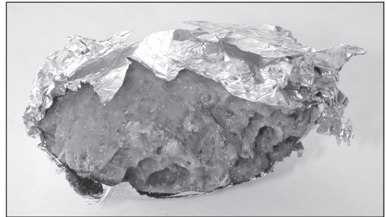
Figure 2. Talon® 50WB bait (wrapped in aluminium foil) showing typical mouse feeding damage.