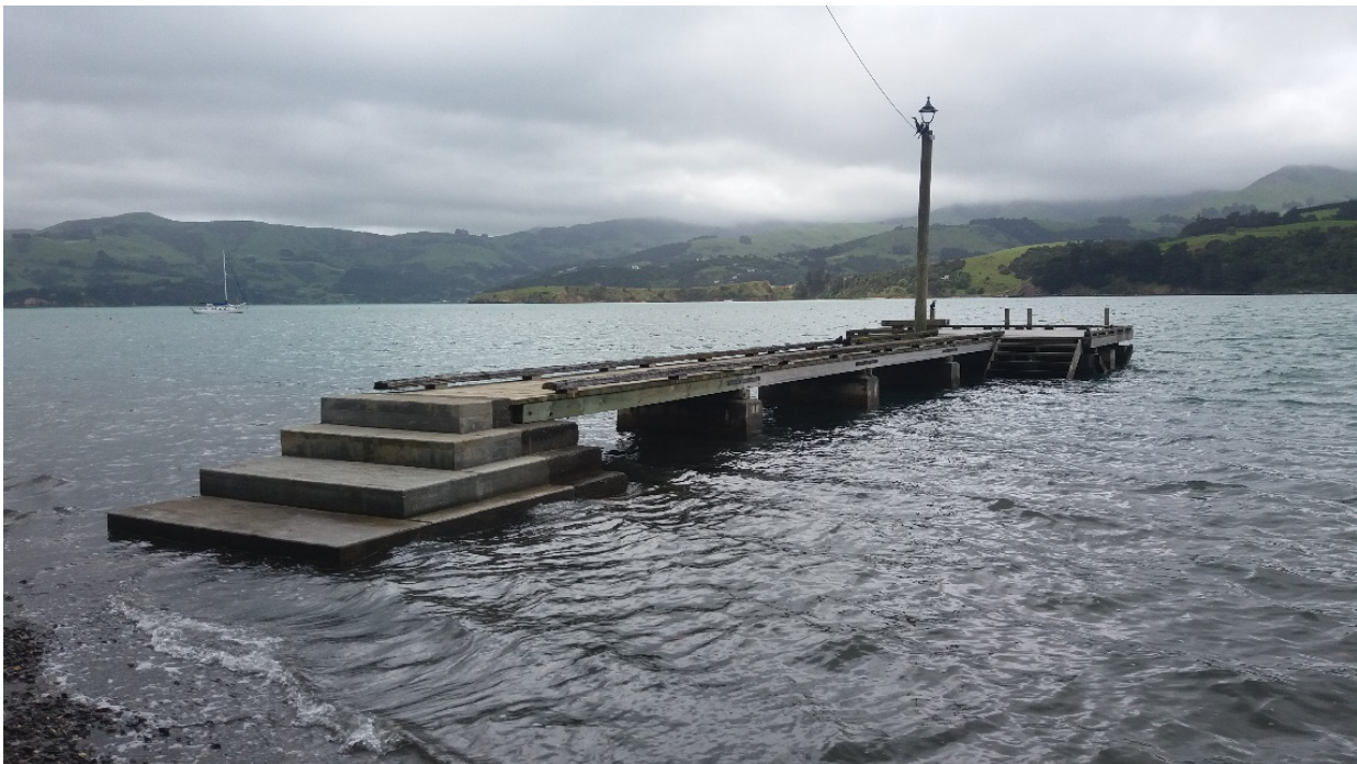
Takamatua jetty high tide 2021. Photo courtesy of Hamish Rennie (1 December 2021)

Restoration was overseen by a council representative, who also oversaw the Church Bay jetty restoration. The jetty was successfully restored in March 2018.