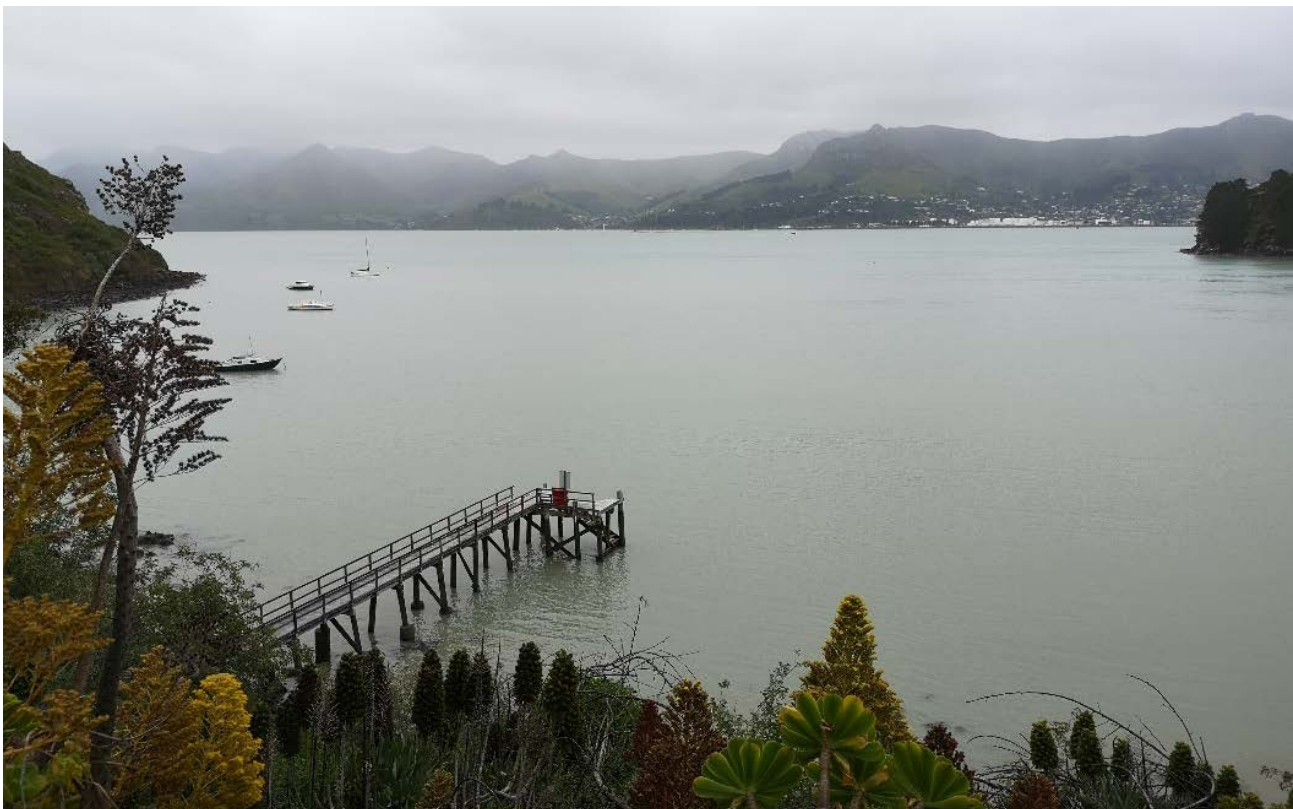
Church Bay jetty 2021. Photo courtesy of Kate Oranje (2 December 2021).

The jetty was successfully restored in December 2016. The overall effect was “bringing the community together” for the “big brand new opening for the jetty”, with the occasion marked by a sign stating “We have saved our jetty”. Kaioruru / Church Bay jetty was subsequently used as a ‘blueprint’ for other jetty restoration projects around the Peninsula.