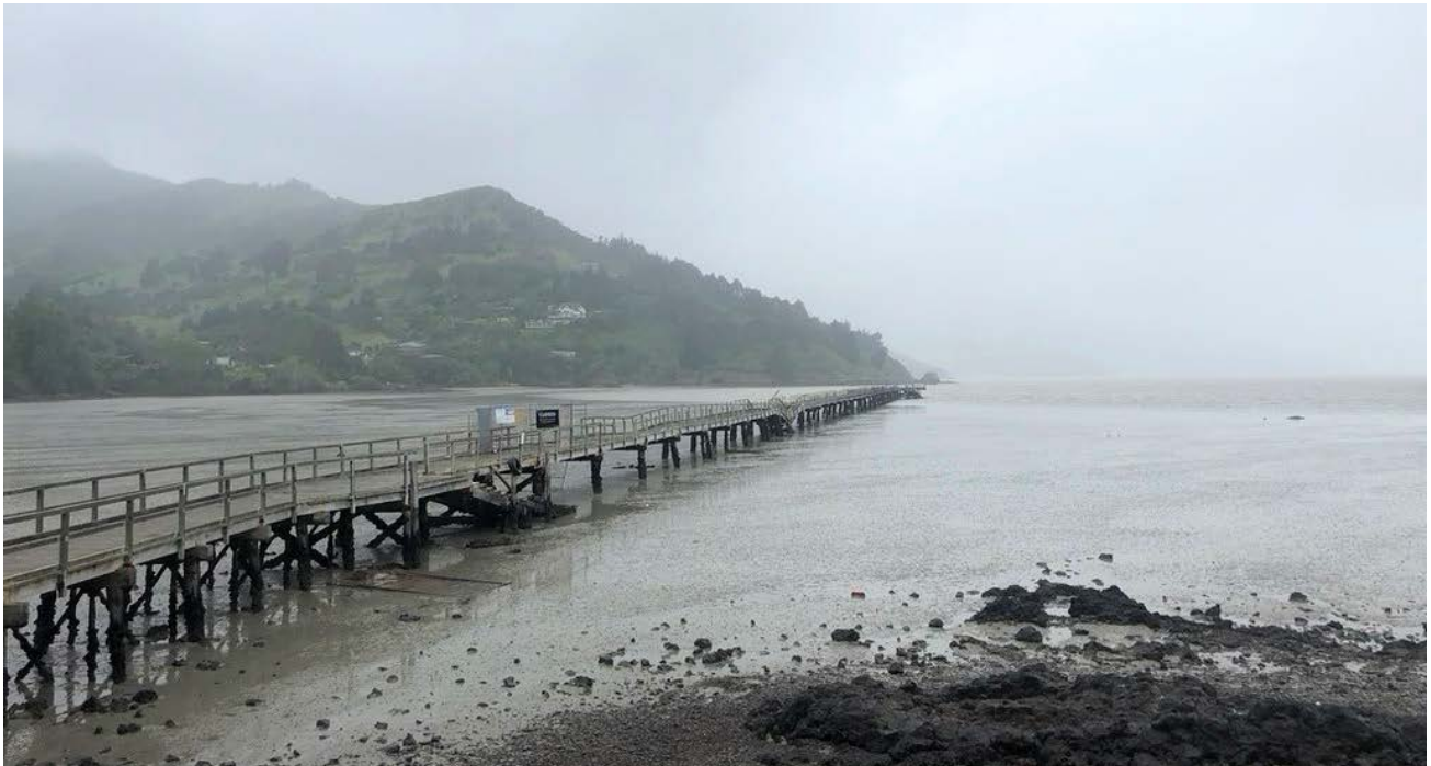
Governors Bay jetty. Photo courtesy of Kate Oranje (2 December 2021).

Numerous fundraising activities have been undertaken over the years as a coordinated effort by the Trust, and the Council has agreed to match the money raised dollar for dollar. The jetty is finally due to be rebuilt with anticipated completion in 2023.