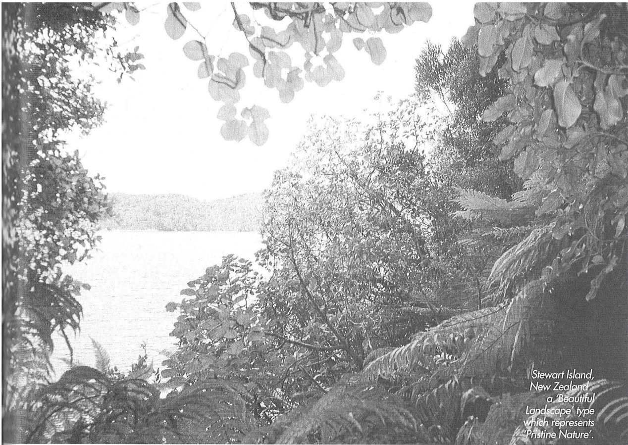
Stewart Island, New Zealand - a 'Beautiful Landscape' type which represents 'Pristine Nature'.