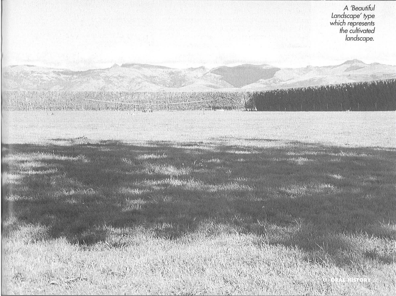
A 'Beautiful Landscape' type which represents the cultivated landscape.