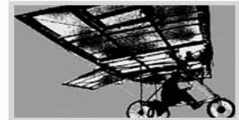
First powered flying machine

Quisque hendrerit ligula ante. Sed purus lacus, eleifend nec pretium eget, aliquet vitae tellus. Pellentesque habitant morbi tristique senectus et netus et malesuada fames ac turpis egestas. Aliquam pellentesque lacus interdum ante congue congue. Nam consectetur diam sed est venenatis vitae imperdiet tortor imperdiet. In condimentum molestie sapien quis sagittis. Nulla blandit congue varius. Integer et justo mi, sed rutrum ipsum. Nunc eros turpis, varius ut laoreet vel, pharetra sed ligula. Nam condimentum turpis a metus tempus aliquam. Mauris a ipsum quis orci iaculis tempor a eu erat.