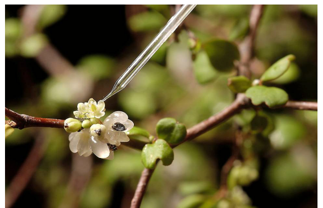
Extracting nectar from the native Muehlenbeckia astonii flower.

A beautiful native flower, ( Parsonsia heterophylla – Maori jasmine). This flower has been investigated for its nectar sugar ratios.