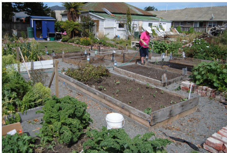
Figure 4 View across garden showing final set of timber beds.