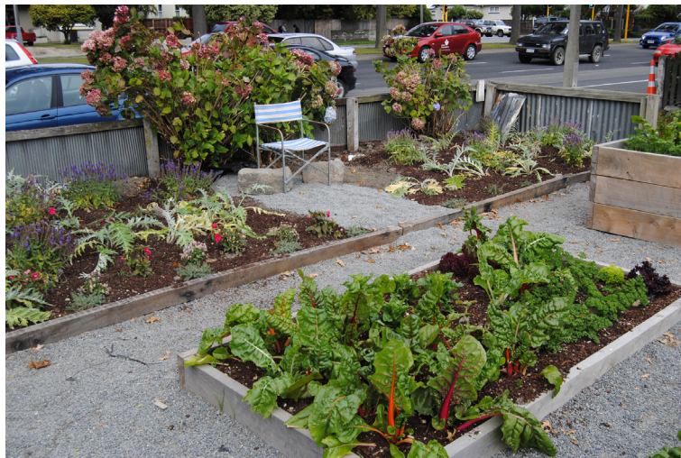
Figure 3 Street frontage shortly after construction.