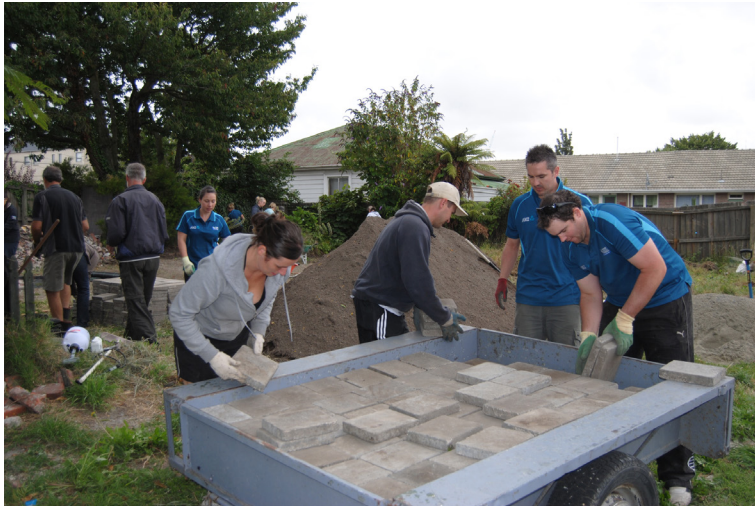
Figure 5 Australia New Zealand (ANZ), bank volunteers carrying out paving (2012).