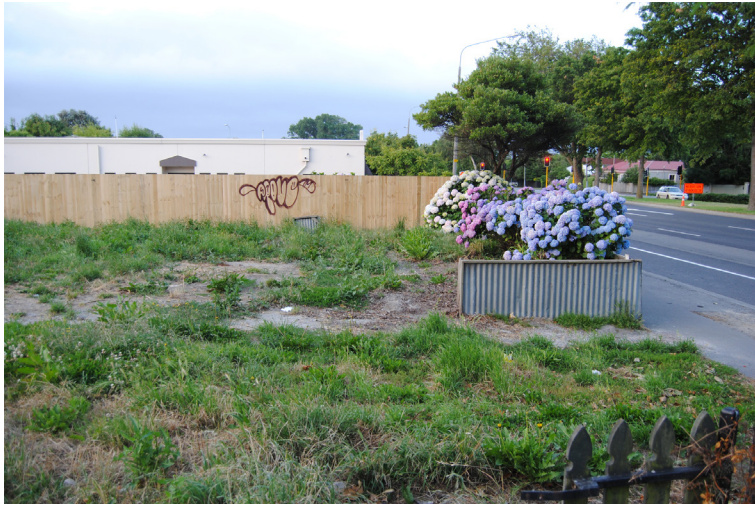
Figure 2 Site prior to commencement.