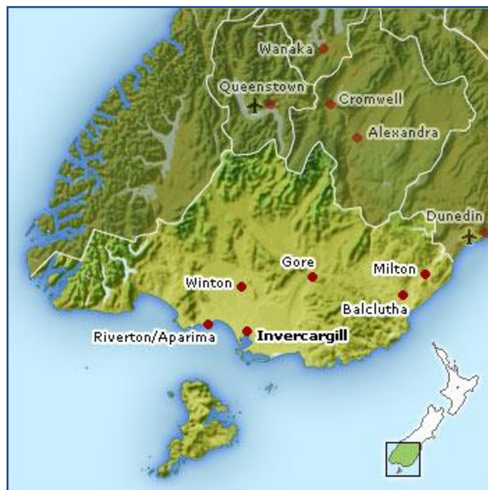
Figure 2: Map of Southland

To answer these questions, the research team held three discussion groups in Southland (Figure 2) in April 2012. Two discussion groups were held with migrant dairy farm employees and one with dairy farm employers, all in Winton. In addition to this, an informal meeting with community advocates in Invercargill was held. The results of these discussion groups are presented and arranged around the migrants' experiences of the New Zealand dairy industry and include interactions with the community, impressions of services available, and immigration experiences.