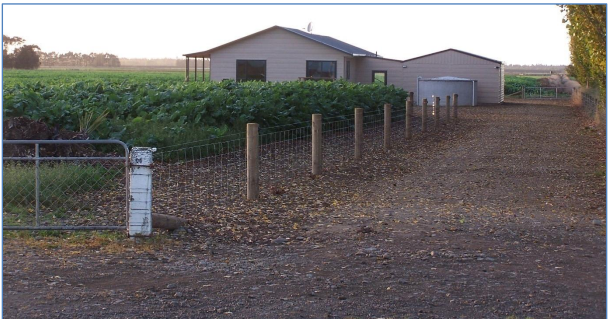
Figure 1 Example of dairy farm employee housing in Southland