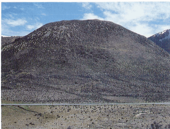
Bridge Hill block, Flock Hill Station. Typical vegetation patterns in the eastern high country (October 1989).

This group comprised central government bureaucrats and several politicians.