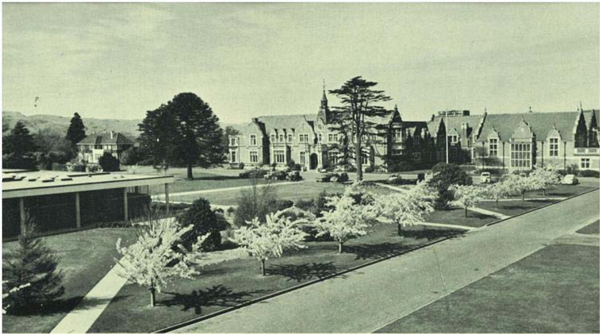
SPRINGTIME AT LINCOLN. (from left) THE LIBRARY, THE PRINCIPAL'S HOUSE AND IVY HALL

Above: Lincoln University outlook circa 1964 depicting (Left to Right): The Lincoln University Library (currently housing The Lincoln University Bookshop), The Principal's House (currently called The Lodge, housing the AERU), Ivey Hall (currently housing the George Memorial Library) and Memorial Hall (currently undergoing reconstruction).