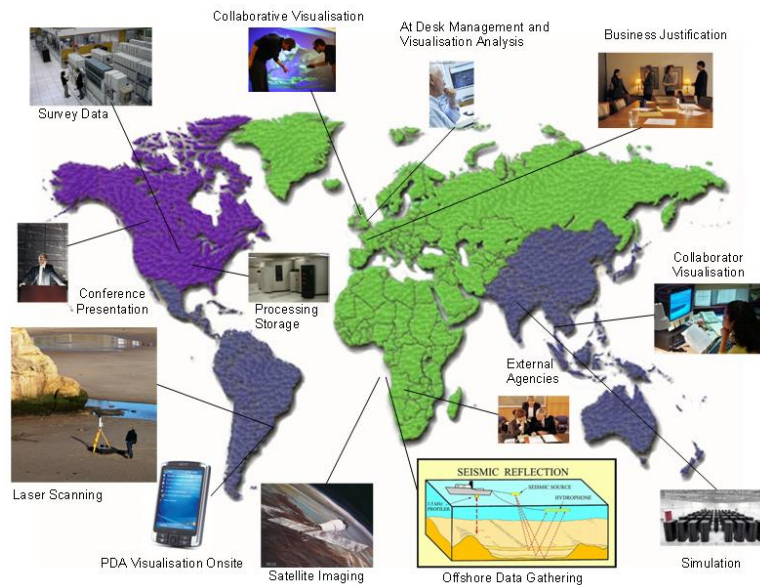
Figure 2: eResearch Visualization Scenario