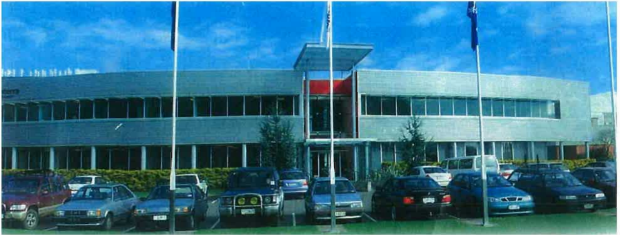
Fonterra Research Centre, Palmerston North, New Zealand