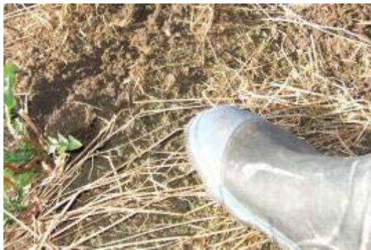
Grass Grub 2