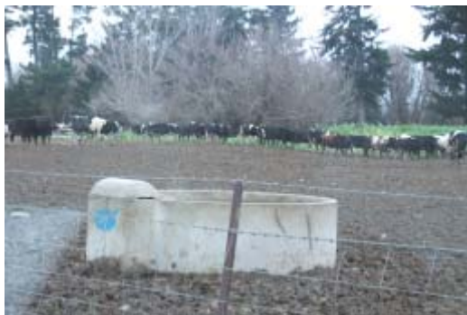
Waiting to be Fed