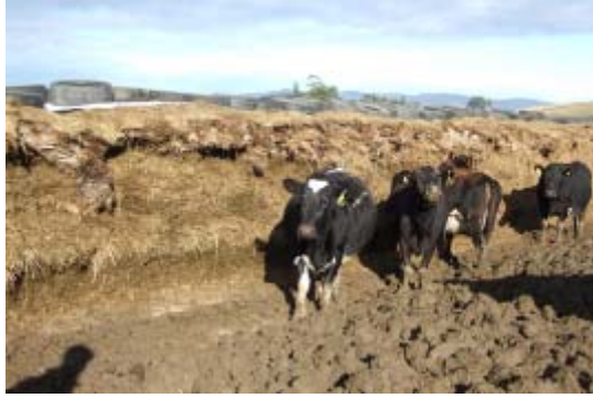
Self Fed Stack 2