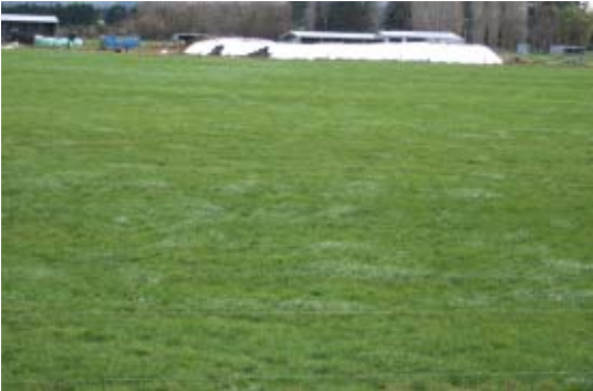
Lower DSL 1