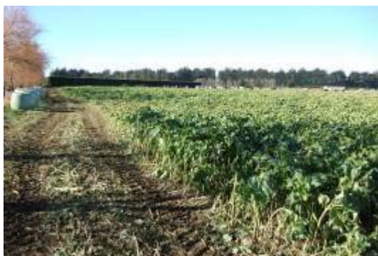
12 Ton Crop