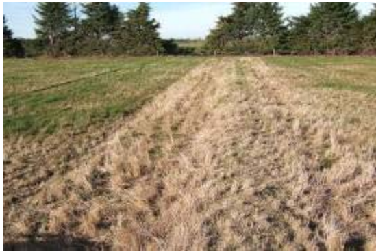
Grass Grub 1