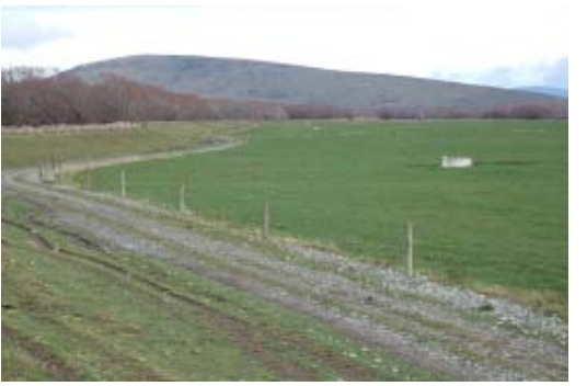
Lower DSL 2