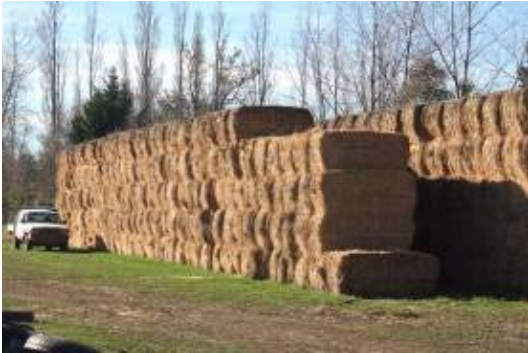
Feed on hand