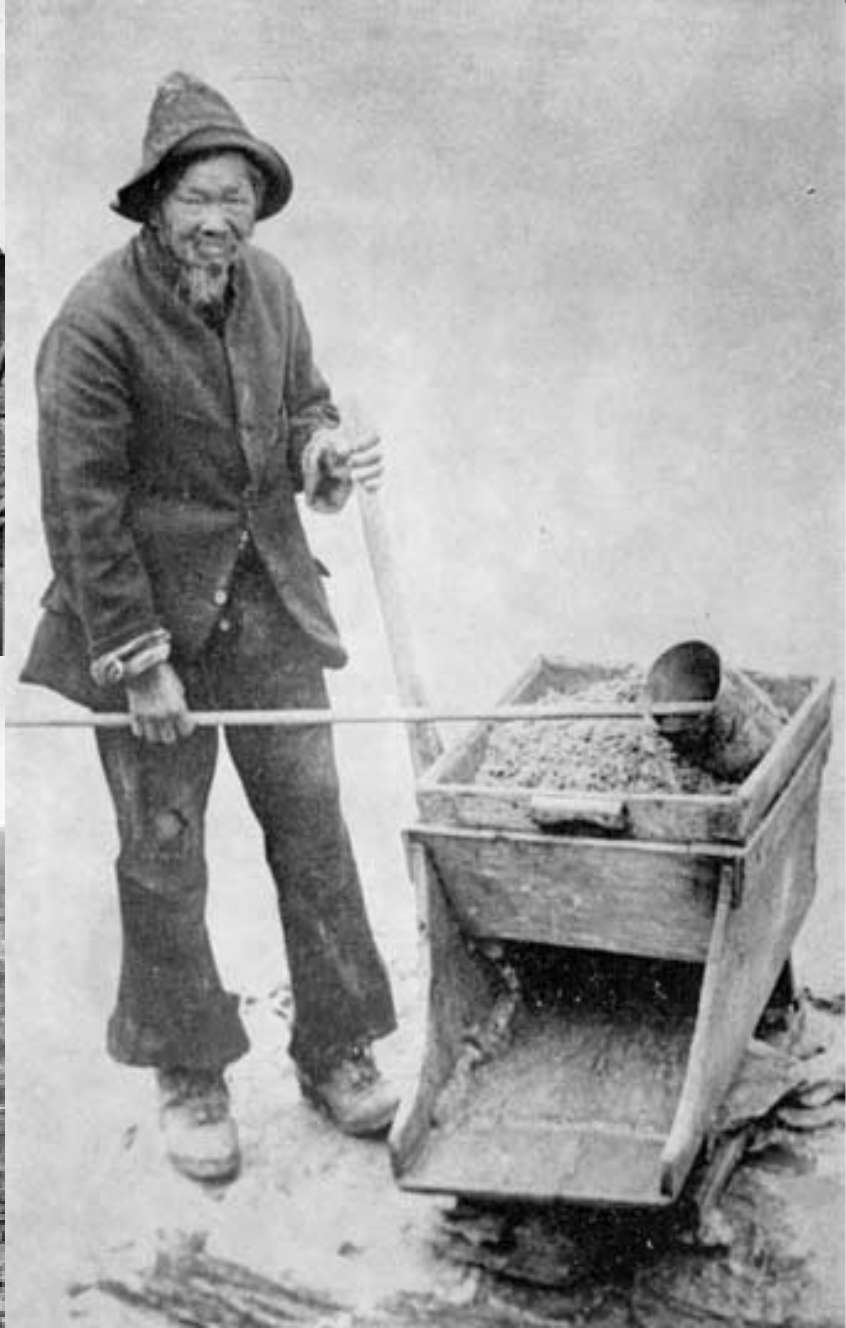
Chinese gold miner, Clutha River