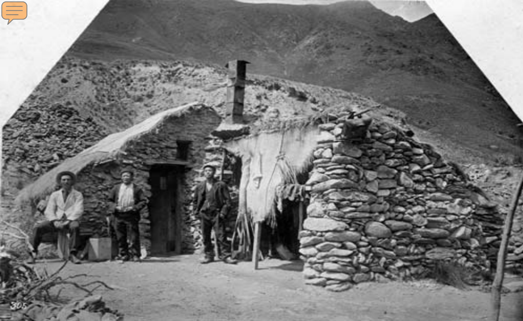
Chinese gold miners, Otago, about 1900