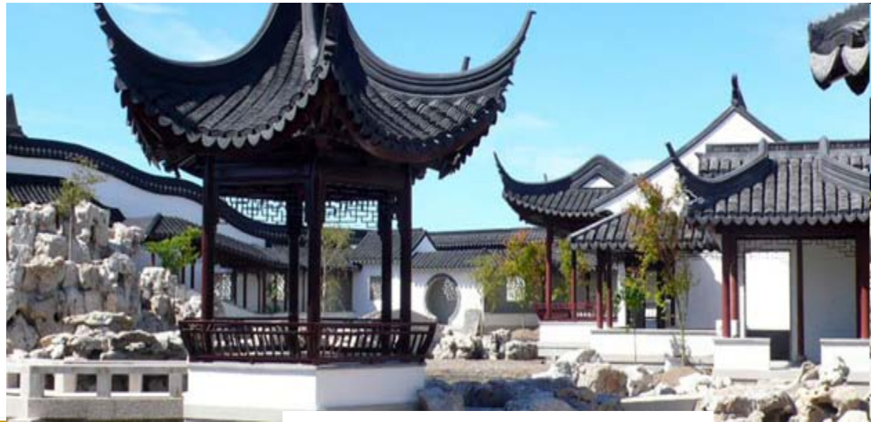
Chinese Garden, Dunedin