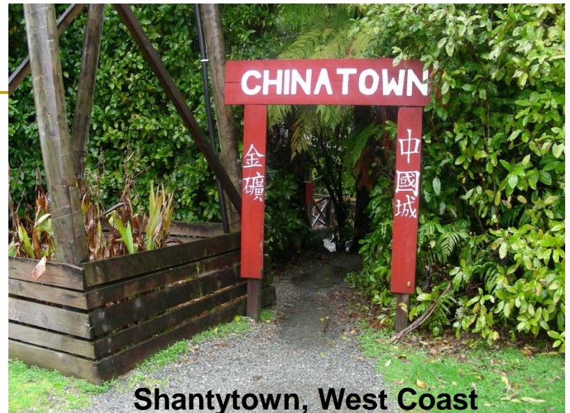
Shantytown, West Coast