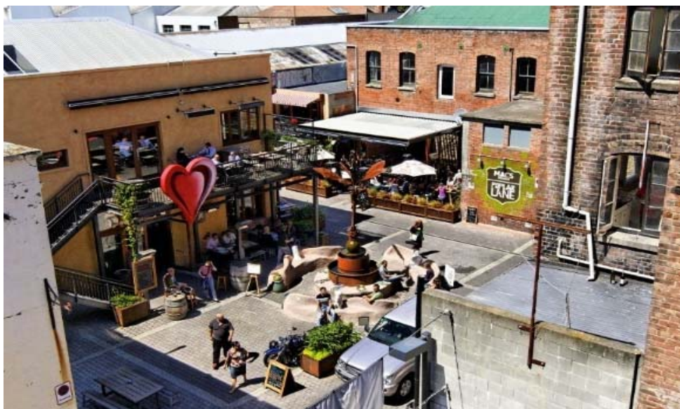
Figure 1: Lichfield Lanes area pre-earthquakes.

There followed prolonged political wrangling over the CBD rebuild, which was led by the Canterbury Earthquake Recovery Authority [CERA]. This research into CBD revitalisation was interrupted as a consequence, and did not fully resume until 2013, by which time it had necessarily taken a different direction.